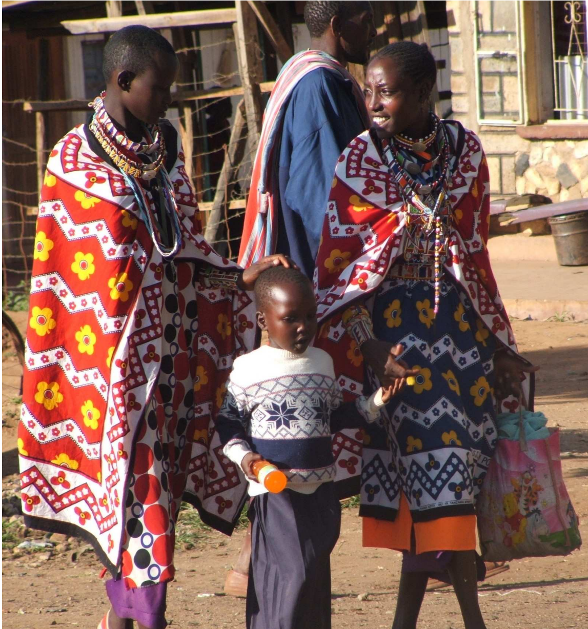
Maasai women, Kenya.

Opposition to technology evaluation can be expected from some industries and governments. Arguments against undertaking technology assessments historically revolve around protestations that the assessments are premature – or, alternatively, too late – are too costly, or are not worth the potential delay in commercial deployment or risk to competitive advantage. 342 However, there is reluctant recognition from many parties, and within the UN, that ‘business as usual’ is not working. In the absence of any technology assessment mechanism to deal with intergovernmental concerns and transboundary issues, the UN has had no structural alternative but to adopt three moratoria related to new technologies since the beginning of the 21 st century, namely, on GURTs (genetic use restriction technologies, or Terminator seeds) in 2000; on ocean fertilization in 2008; and a general moratorium on climate-related geoengineering in 2010, which was reaffirmed in 2012 – all under the aegis of the Convention on Biological Diversity (CBD).