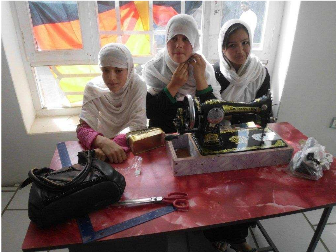
WECF partner Katachel prepares women and families in Kunduz for the winter by organizing a sewing project in Kunduz, Afghanistan.

As mentioned above, gender discrimination in social and economic roles also exacerbates women's environmental vulnerability. Women are at a higher risk from and are disproportionately affected by climate change and environmental degradation, because they have access to fewer resources — including land, credit, agricultural inputs, technology and training services, and participation in decision-making bodies — and this impedes their ability to avoid or adapt to various situations. 214 The lack of basic social protection increases women's dependency on natural resources and decreases the likelihood that they can overcome environmental distress.