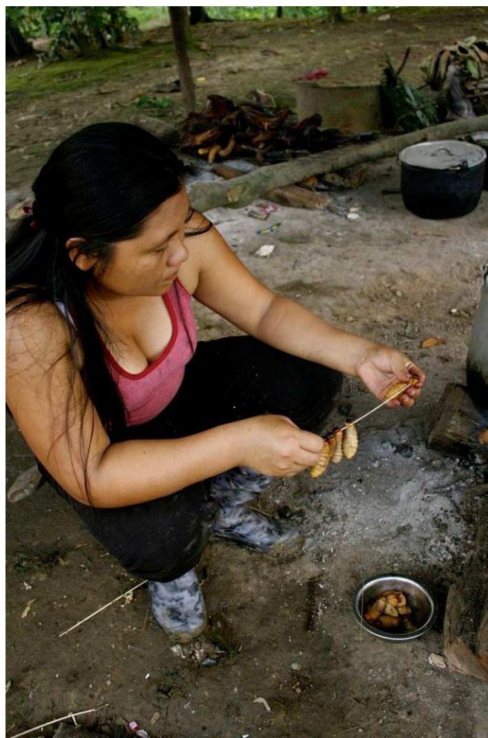
Sapara woman. Ecuador. Photo: Indigenous Peoples Biocultural Climate Change Initiative. See http://ipcca.info

Effective governance and respect for women's rights are key prerequisites that enable women to engage in these processes. A serious shift towards sustainable development requires gender equality and an end to persistent discrimination against women at all levels of biodiversity and cultural resources use.