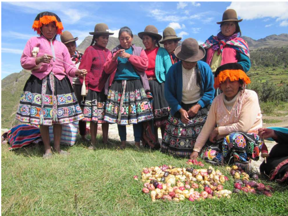
Integrate gender-sensitive solutions to climate change and facilitate women's equitable participation in decision-making processes at all levels. Photo: Indigenous Peoples Biocultural Climate Change Assessment Initiative. See also: http://ipcca.info

UNCSD Secretariat, 2012. Current Ideas on Sustainable Development Goals and Indicators RIO 2012 Issues Briefs Produced by the UNCSD Secretariat No. 6 In: https://docs.google.com/gview?url=http://sustainabledevelopment.un.org/content/documents/327brief6.pdf&embedded=true