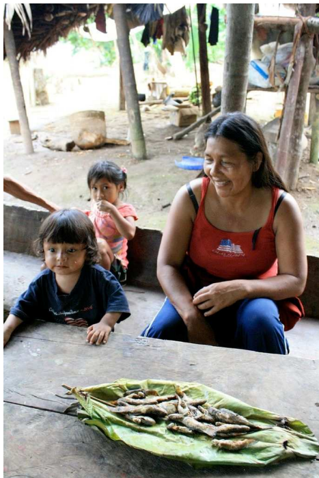
Sapara woman, Ecuador. Photo: Indigenous Peoples Biocultural Climate Change Initiative. See http://ipcca.info

Women's rights have been severely curtailed by the industrialisation of agriculture. The Green Revolution of the 1960s exposed small and landless farmers across the South, especially in Asia, to a wide range of negative social and ecological conditions, and compounded the exploitation experienced by women under existing feudal and patriarchal systems. Subsequent trade liberalization policies imposed on developing countries have exacerbated the situation, putting small and landless farmers, especially women farmers, at risk in multiple ways. The current economic, ecological and food crises are now pushing women and their families to the limit, with the starkest impacts being felt by the poorest, hungriest households.