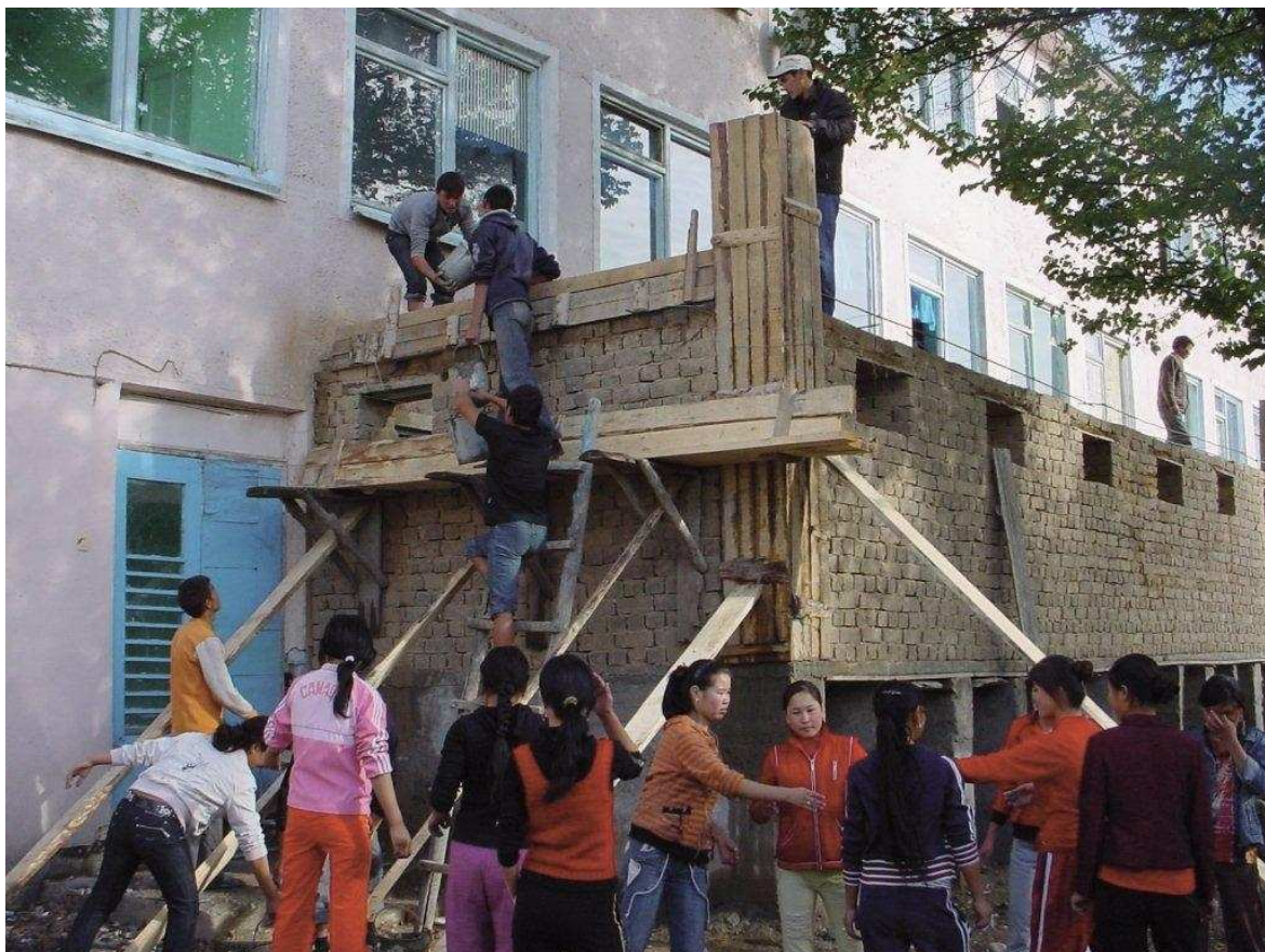
Women implementing energy saving measures at a school in Kyrgyzstan, by building solar collectors and training on sustainable insulation methods.

When asked, most people don't want to put their money into activities which kill other people, or which destroy their own health or environment. Nevertheless, almost all of us do. When analysing the investments of the major retirement funds, these funds invest in companies that are directly linked to undesirable products and processes, such as the tobacco industry, oil, gas, mining, uranium, pesticides and even arms. The investment and banking sector is probably the main driver for unsustainable development and indirectly, human rights abuse. At the same time, financial speculation with commodity prices has increased the number of hungry people in the world 32 . The extractive industry sector and the chemical industry sector have made their greatest profits ever last year, in the middle of the financial crisis, with the largest corporations making 30-50 billion profits per company in one year, even though they are responsible for among the greatest environmental harm in the world, - and in most cases they are not paying for the damage and clean-up. Clearly our financial system is a barrier to a sustainable and equitable economic system. Governments need to re-regulate corporations and the banks, going well beyond the first steps taken by the EU on bankers' bonuses.