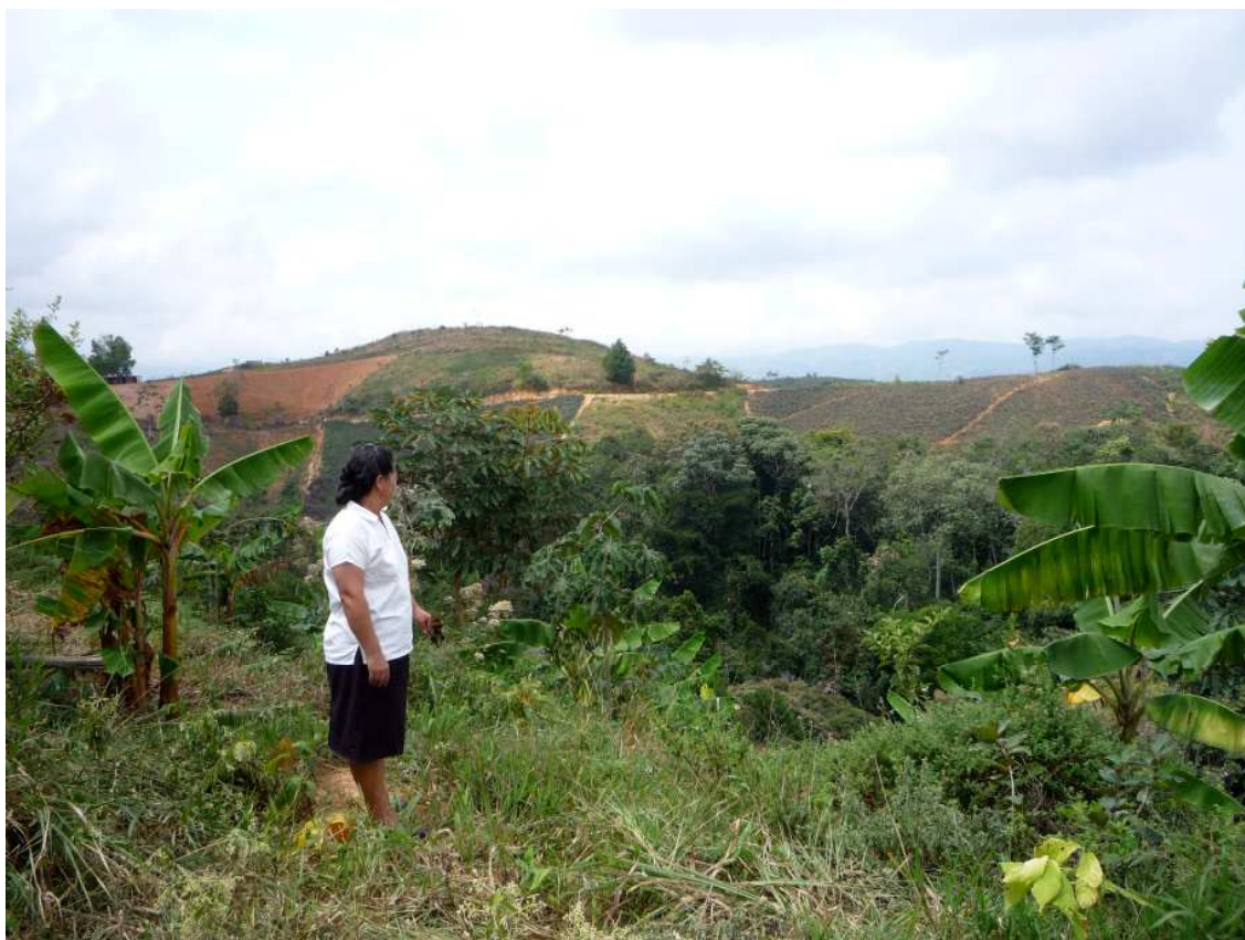
Woman from an agroecology farm in Lebrija-Santander, an area heavily affected by pineapple monocultures, where the community, including women's groups, have gathered together to restore the ecosystem by using traditional practices and using environmentally friendly techniques. Colombia.