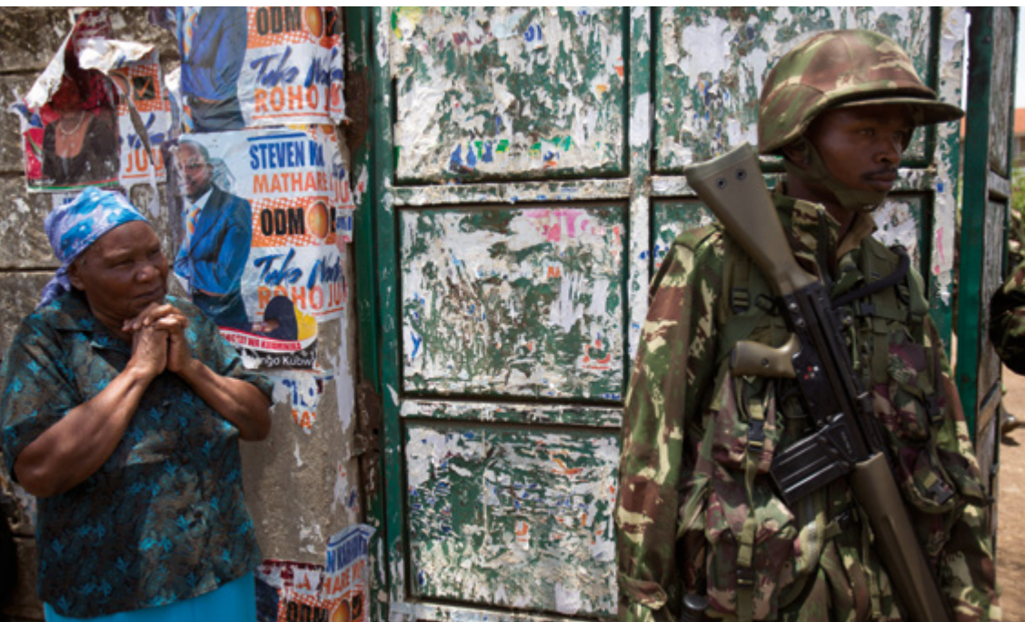
A woman waits outside a tallying centre with a Kenyan police officer guarding the gate at Mathare slum in Nairobi, 6 March 2013.

crowdsourcing experience) to provide women with a stronger platform for identifying and mitigating incidents of violence, such as those witnessed in Haiti after the 2010 earthquake. These tools are being incorporated into efforts to monitor election violence targeting women, a phenomenon frequently invisible to the public as a result of unreported incidents. The crowdsourcing-mapping tool used by Ushahidi to map election-related violence in 2007/2008 in Kenya has been applied for the purposes of early warning in other parts of Africa. In Mali, for example, UN Women has supported its application as part of a "Situation Room" model, also used previously to support women candidates in Senegal and Sierra Leone. The initiative relied upon incident reports collected through text messages and cell phones as well as other ICT tools to provide rapid response to victims. 3