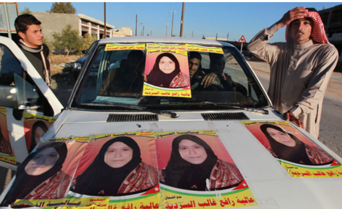
Supporters of a woman candidate post her pictures on their car in Al Mafraq City near Amman, 19 January 2013.

roughly doubled their presence in the lower house (to 18.6%) and reached 26.5 per cent in the upper. Among the year's historic milestones was the election of Peris Pesi Tobiko, the first Maasai woman to enter parliament, and of five women senators (out of the current 18) between the ages of 24 and 33. No women were elected at all, on the other hand, to more than half of the country's subnational assemblies despite a constitutional provision prohibiting more than two-thirds membership for either sex.