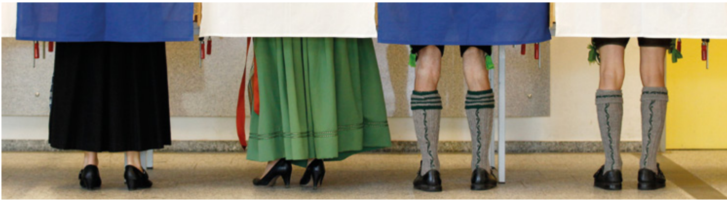
Voters wearing traditional Bavarian dress cast their ballots in German general election at a polling station in Gaissach, 22 September 2013.

representation systems, open or closed candidate lists have an important effect on women's electability. Where candidate quotas exist, closed lists tend to favour women's access to parliament. However, in the absence of quotas, open lists afford women greater opportunity to compete because they allow voters a certain flexibility in selecting candidates. Majoritarian electoral systems limit women because, amongst other reasons, they provide fewer opportunities for representation.