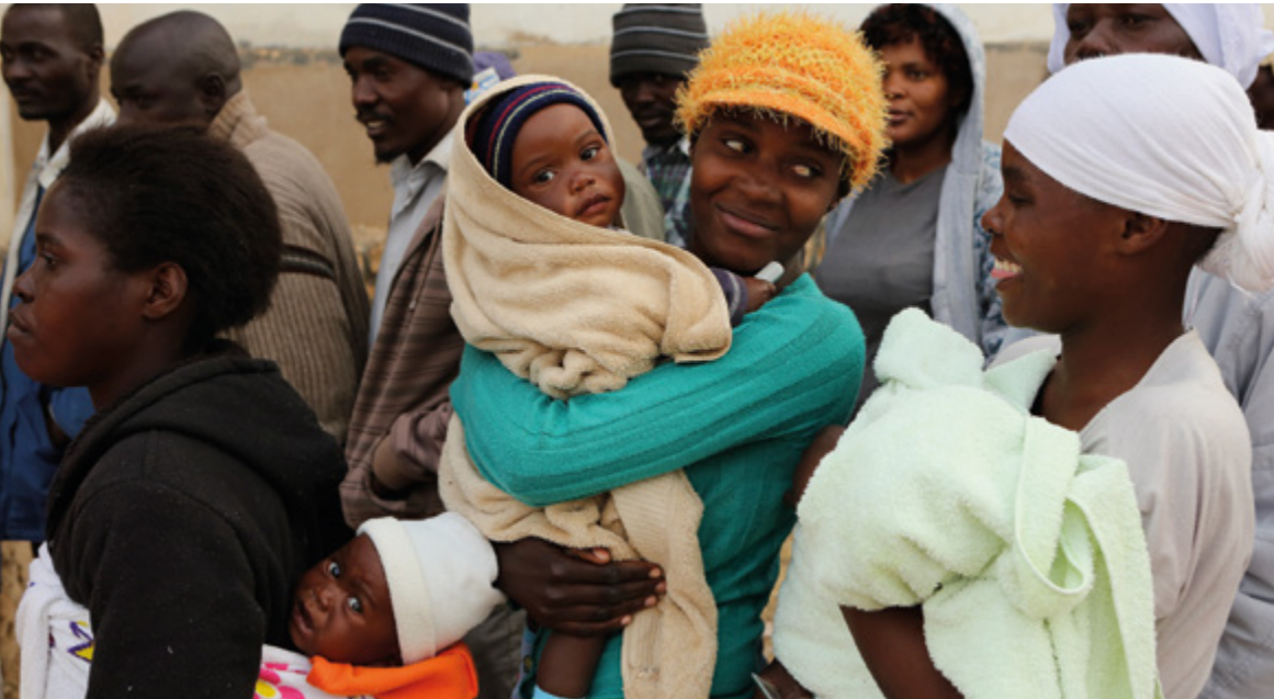
Zimbabwean women wait to cast their votes at a polling station in Domboshava, 31 July 2013.

2013 breaks all the records for women's participation in parliaments worldwide. The percentage of parliamentary seats occupied by women rose to 21.8 per cent, an increase of 1.5 percentage points – double the average rate of increase in recent years.